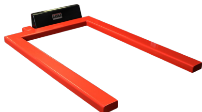
** The RAVAS RWB ND model