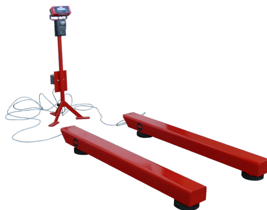
The RAVAS RWB DE model with tripod