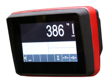
RAVAS 5200 indicator