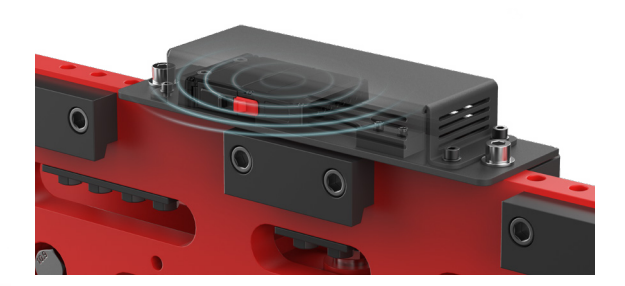
wireless - via Bluetooth