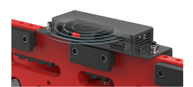
wireless - via Bluetooth