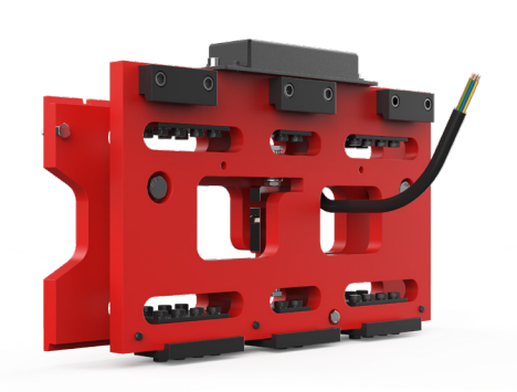
cabled - via spiral cable