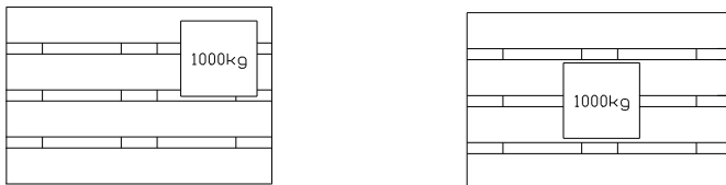
Non-optimal placement of the load

The most accurate weighing result is obtained when the centre of gravity of the load is placed between the forks. With a non-centric loading, the forks will torque and bend. This may result in a higher inaccuracy.